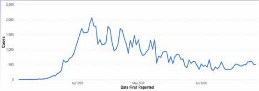
Pa. Dept. of Health reports a decline in COVID-19 cases since April.

Thanks to your commitment and sacrifice, Philadelphia has made major progress in flattening the curve and stopping the spread of the coronavirus.